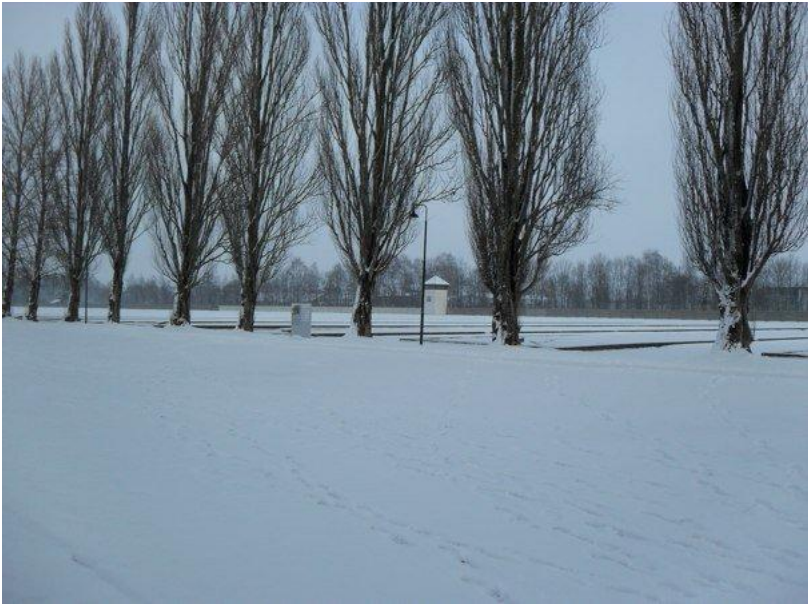
Only two living quarters are still standing, the rest are marked with cement slabs and labeled with a number