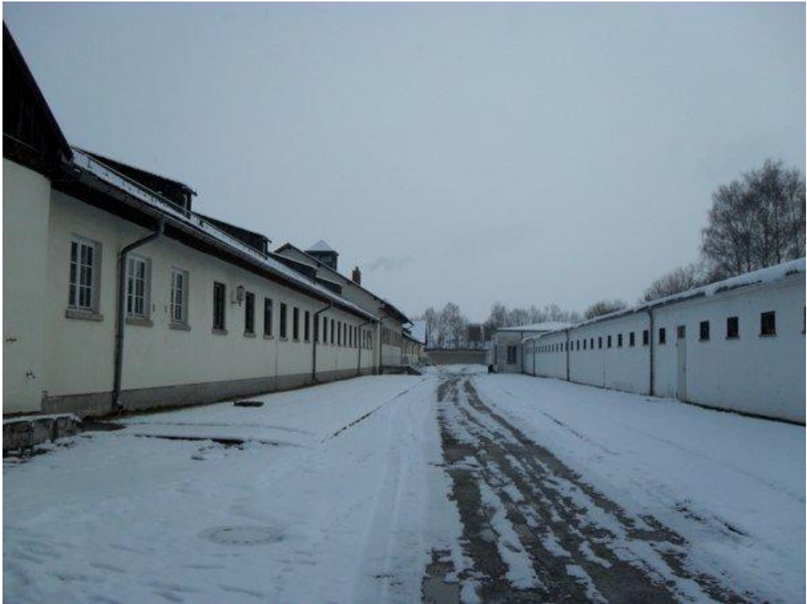
The Bunker Building (Prision)