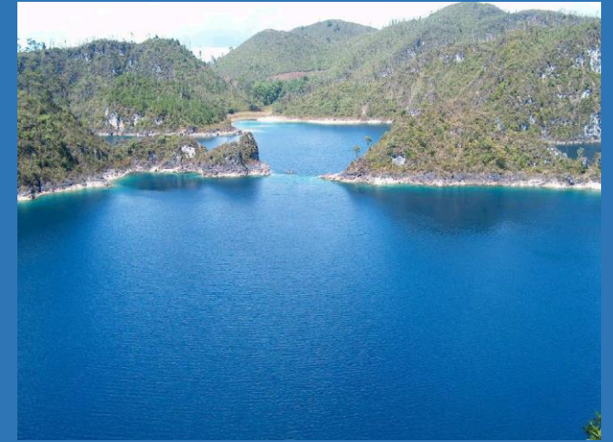
Chiapas (Mexican State)