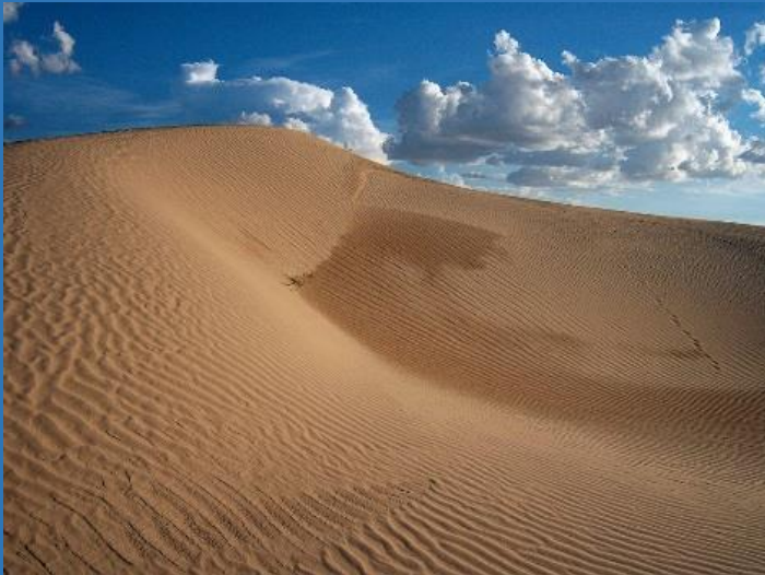
Chihuahua (Mexican State)