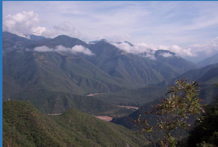
Sierra Madre Mountains